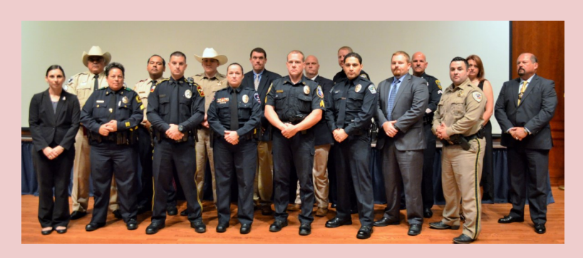
2015 Award Recipients