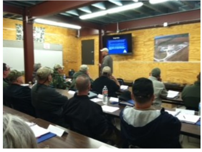
Future school marshal instructors attending the first train the trainer course at the ALERRT facility