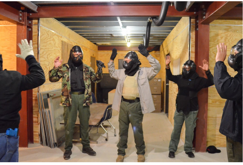
Student trainers are evacuated from their mock classroom during an active shooter simulation