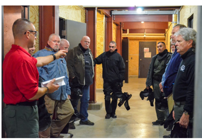
ALERRT instructor describes simulation scenarios and tasks of each role

Attending the training were 18 instructors representing police training academies across Texas. The train the trainer course consisted of five intensive areas of study: physical security, use of force and legal liabilities, firearms training, effective law enforcement strategies and techniques,