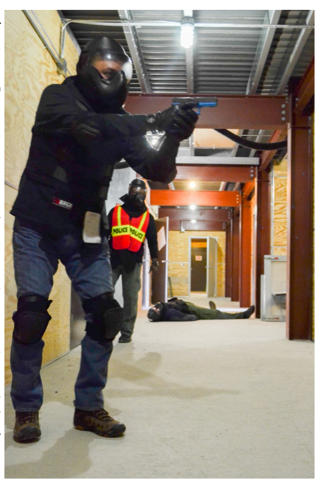
An instructor (in vest) observes from a distance as a trainee portraying a school marshal takes down the suspect and proceeds to secure the premises

TCOLE approved academies will host the 80 hour school marshal training course later this summer. The course has been designed to emphasize strategies for preventing school shootings and securing the safety of potential victims of school shootings. It will also educate a trainee about legal issues relating to the duties of peace officers and the use of force or deadly force in the protection of others, introduce the trainee to effective law enforcement strategies and techniques, improve the trainee's proficiency with a handgun, and enable the trainee to respond to an emergency situations requiring deadly force, such as a situation involving an active shooter. Individuals participating in this newly designed program must be a school district employee who already possesses a current concealed handgun license through the state of Texas. must be appointed by the board of trustees of their school district or the governing body of an openenrollment charter school. This training will give school districts another option for protecting their student population.